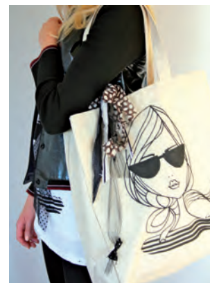
IRMA T-shirt (one size fits all) with tulle bow detail, IRMA Art Postcard set, and IRMA canvas shopper with vintage cotton ribbons